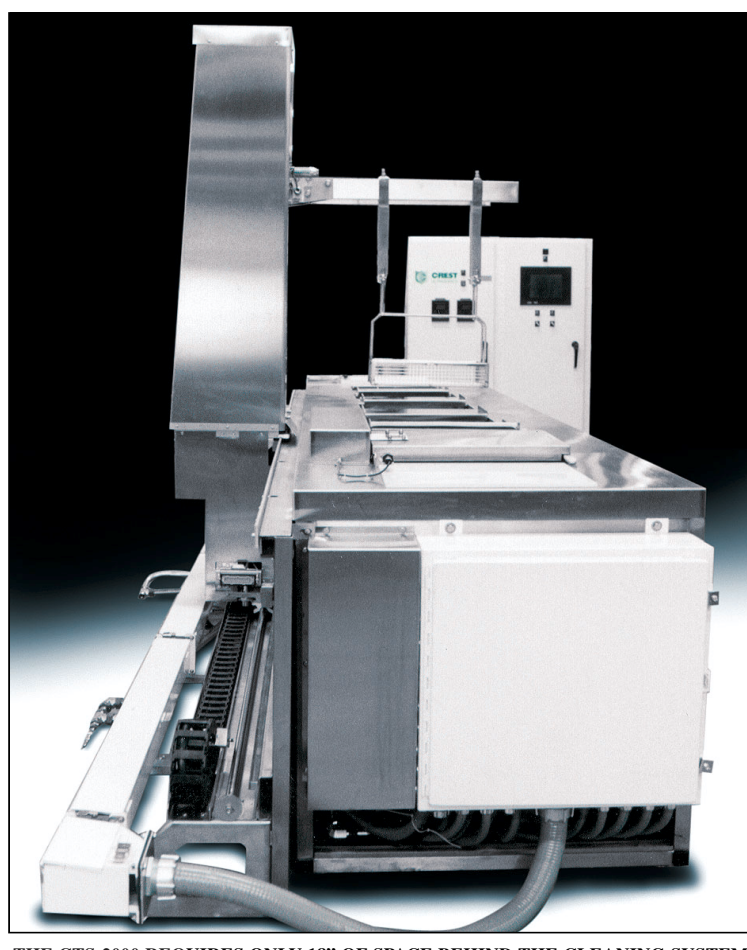
THE CTS-2000 REQUIRES ONLY 18" OF SPACE BEHIND THE CLEANING SYSTEM

The CTS-2000 can be field retrofitted to any existing system with very little downtime and disruption and its robust design will provide years of trouble-free operation.