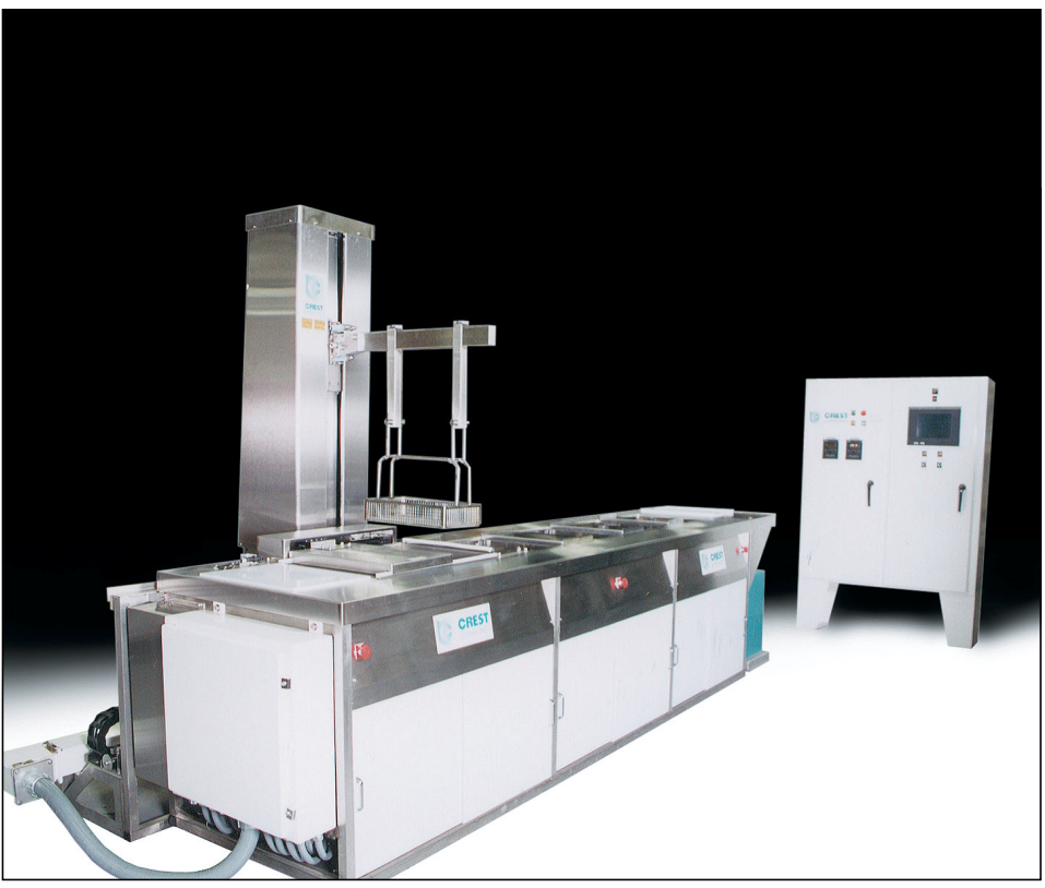
THE CTS 2000 MODEL, PICTURED ON THE OPTIMUM CONSOLE™

Crest's newest automation system, the CTS-2000, sets the standard for performance in its category. Upgrades such as the highest load capacity in the industry, increased processing speed, smaller footprint and several new control options make the CTS-2000 the most versatile automation system available. The control systems are operatorfriendly and allow full, protected control of the process and system parameters and the optional Data Acquisition Package allows you to stay in control of your process. The CTS-2000 employs Crest's unique, yet simple safety features that eliminate costly crashes and minimize downtime.