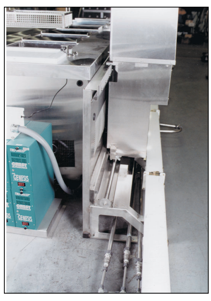
EASY SERVICE CONNECTIONS