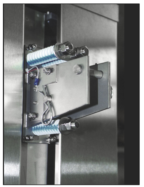
MULTI-AXIS CRASH PROTECTION SWITCH