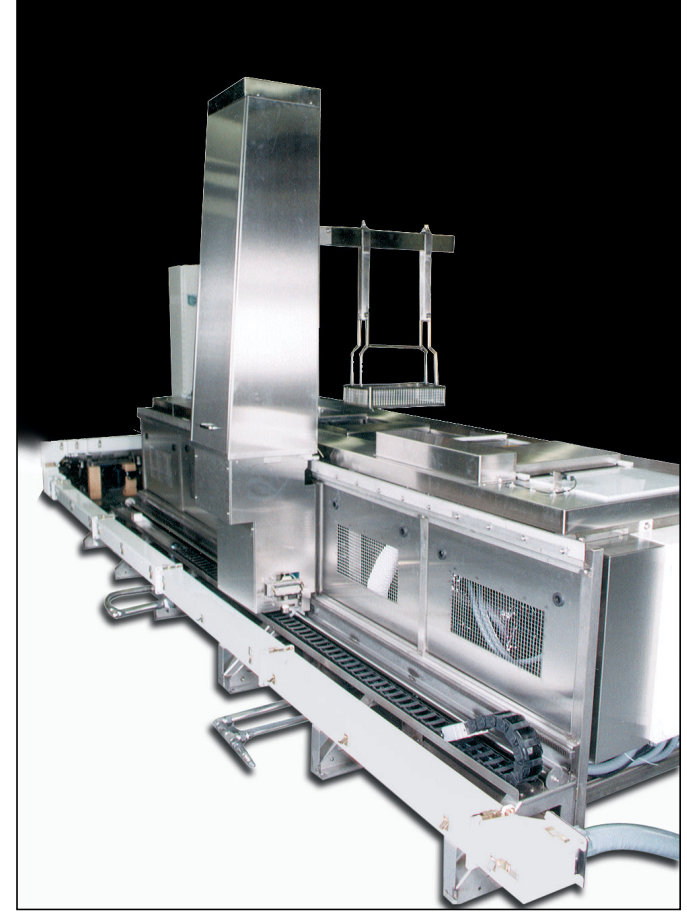
MODULAR GUIDETRACK CAN BE FITTED TO ANY SYSTEM